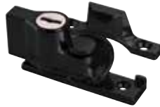
Keyed Sash Lock