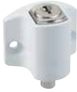
CYL4® Mini Push Lock