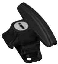
Sliding Window Lock (Diecast)