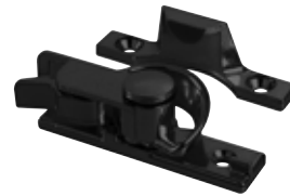
Safety Sash Lock