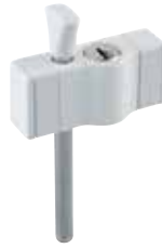
CYL4® Multi Bolt